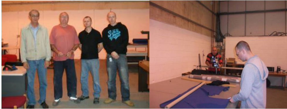
Employees of GreenCap

individuals. Four new jobs have been created in Caerphilly – three full-time and one part time.